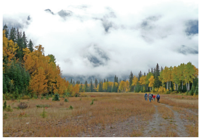
2015 SER ANNUAL GENERAL MEETING BANFF NATIONAL PARK

From February 13 to 17, 2018 the Society for Ecological Restoration - Western Canada Chapter, will host the conference 'Restoration for Resilience: Ecological Restoration in the 21st Century.' Resilience is a hot and challenging topic