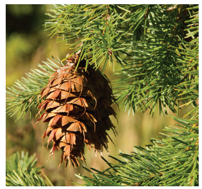
PSEUDOTSUGA MENZIESII AKA. THE NATIVE DOUGLAS FIR

We invite you to partner with us in presenting 'Restoration for Resilience: Ecological Restoration in the 21st Century.' The conference will provide restoration professionals with the networking and learning opportunities they need to successfully restore degraded ecosystems. Your support will help us improve the quality and breadth of the conference program, facilitate participation of students and guest speakers, and provide conference amenities for the benefit of all participants.