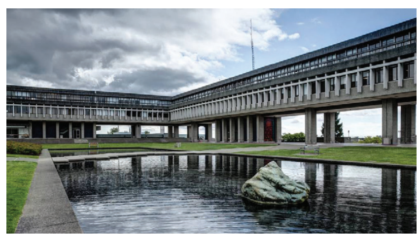
LOCATION SIMON FRASER UNIVERSITY, BURNABY, BRITISH COLUMBIA

'Restoration for Resilience' is projected to attract a wide range of sectors in the restoration field, including researchers, technical professionals, decisions-makers, governmental and non-governmental agency representatives, businesses/consultancies, artists, educators, and community leaders. Three days of plenary, workshop, and poster sessions will address broad questions that appeal to national, regional, and local audiences.