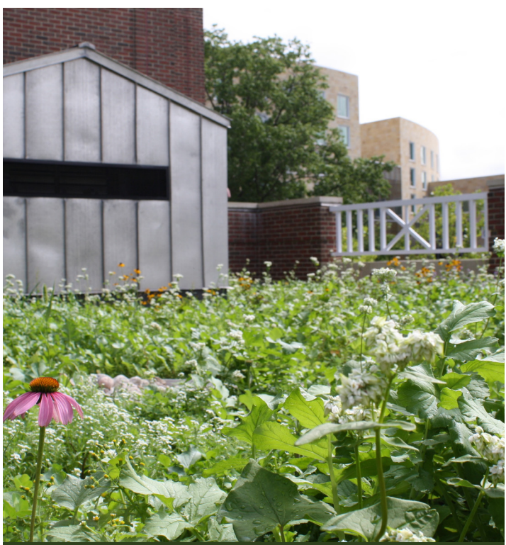
The McArthur/McCollum Building Rooftop Meadow at the Harvard Business school features a wide range of native perennials and edible crops. 2018 Award Winner: Recover Green Roofs & Omni Ecosystems.

With all the benefits that green roofs can provide, why aren't they more common in cities across the country? There are perceptual barriers to green roof installation. One is higher costs. The initial cost of a light weight, low maintenance extensive green roof, is estimated at being twice the price of a comparable traditional roof, which is