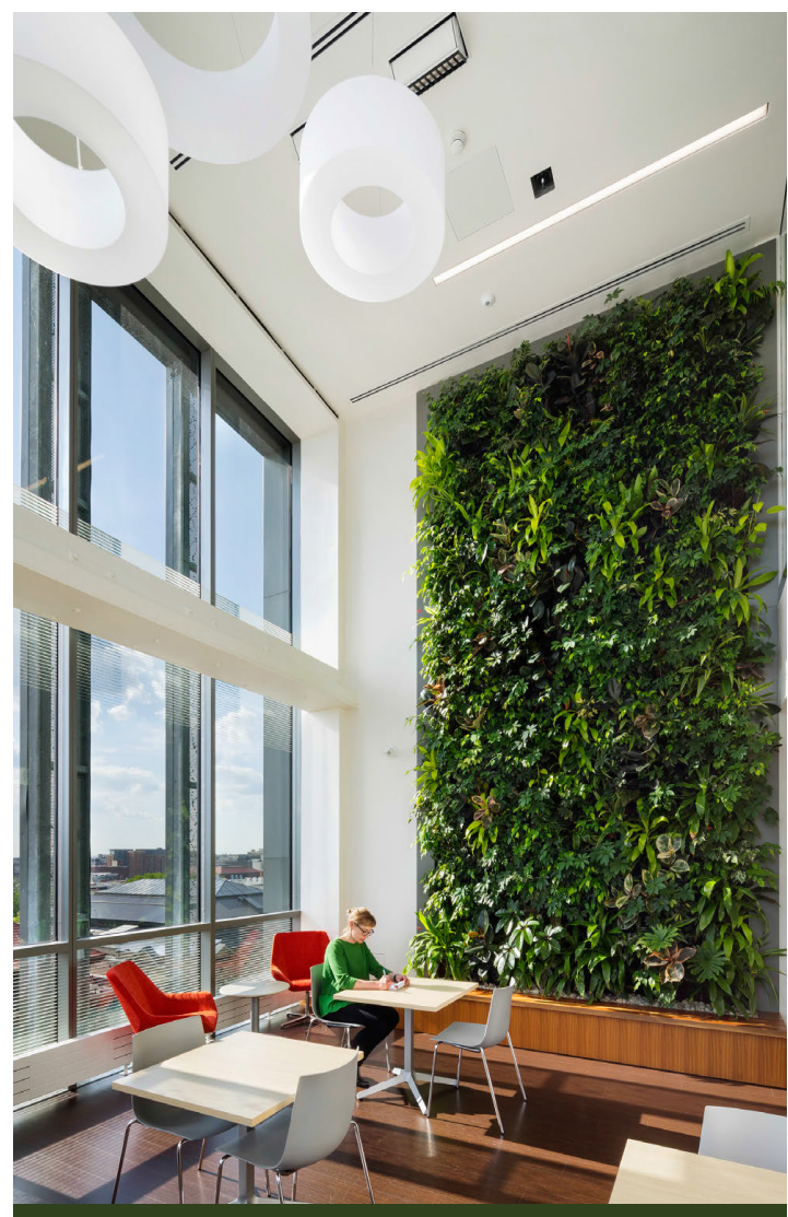
The HVAC-integrated living wall at Weiser Hall at the University of Michigan improves air quaiity and reduces energy costs. 2018 Award Winner: Diamond Schmitt Architects & Nedlaw Living Walls.

Increased exposure to green roofs through municipal demonstration projects can also serve to dismantle