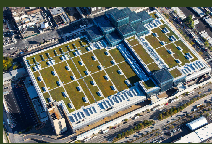
2016 Award Winner: FXFOWLE Epstein

(Assumptions: average industry costs and benefits based on values from the Green Infrastructure Foundation Cost-Benefit Matrix; 20 per cent intensive roofs and 80 per cent extensive roofs).