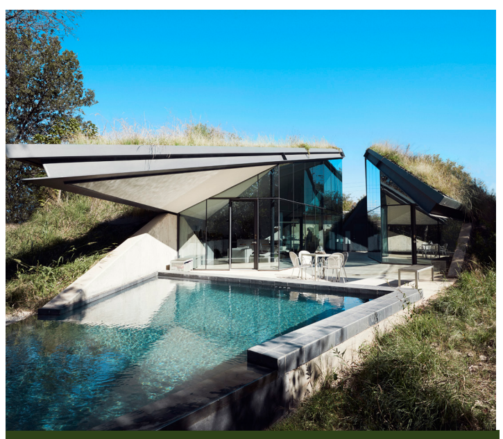
The Edgeland house is designed in harmony with the surrounding Texas environment, featuring a palette of hardy native plants. 2016 Award Winner: Ecosystem Design Group - Lady Bird Johnson Wildflower Center.