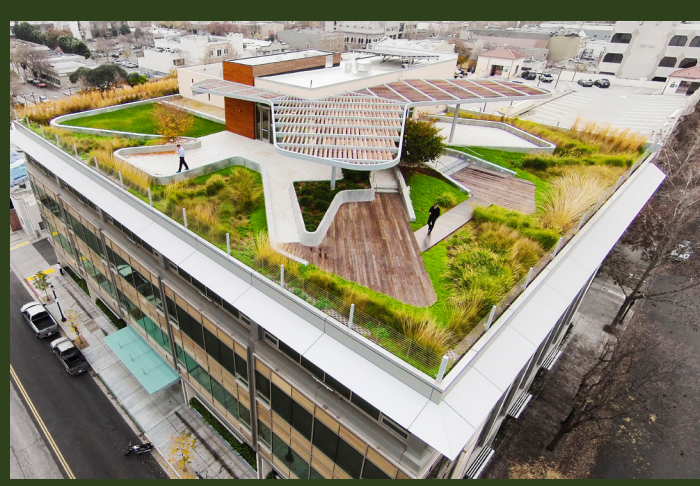
2016 Award Winner: Bionic Landscape