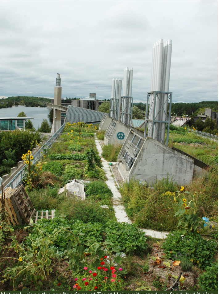
Not only does the rooftop farm at Trent University produce food, but it also encourages pollinators and hosts research and demonstration projects. 2016 Award Winner: ZinCo Canada Inc.

The Living Architecture Performance Tool (See appendix 6) describes potential green roof and wall benefits and provides performance measures, minimum requirements, and examples of how they can be achieved. Many building owners/developers will seek the least costly compliance path so being able to clearly and convincingly define the relative costs and benefits of the technologies is important.