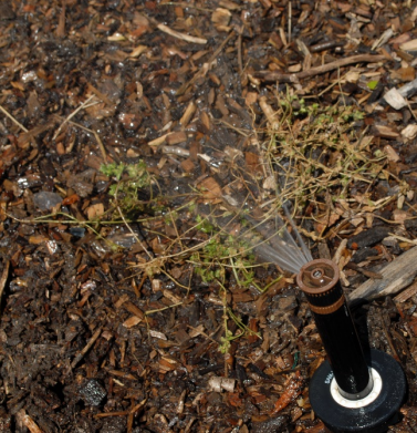
The image at left shows a spray sprinkler with a body that is non-pressure-compensating, resulting in water wasted from misting and overwatering. The image at right shows a pressure-regulating spray sprinkler body that regulates the water pressure to the sprinkler nozzle's optimal pressure.