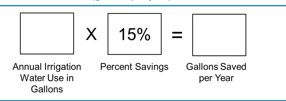
Equation 1. Water Savings From Irrigation Controller Replacement (gallons per year)

EPA estimates that replacing a standard clock timer with a WaterSense labeled controller can reduce irrigation water use by 15 percent.<sup>5</sup> To estimate water savings from installing a WaterSense labeled controller in your system, use Equation 1.