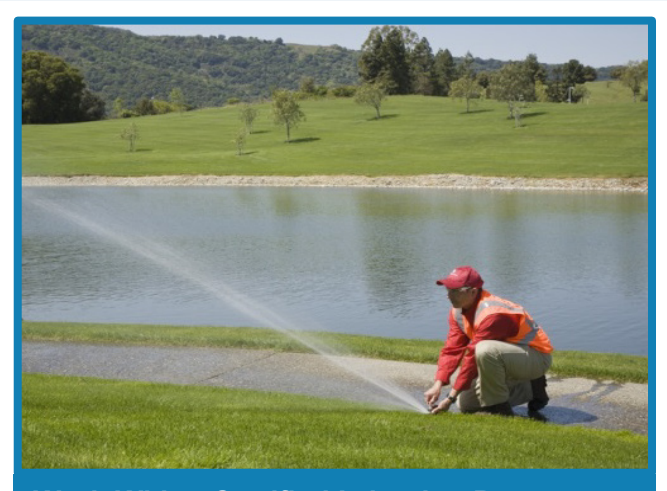
Work With a Certified Irrigation Pro

Consider retrofitting a portion of the spray bodies that water trees, shrubs, or plant beds with micro-irrigation or drip irrigation. Many plant beds do not require the spray heads traditionally used to water turf areas, and drip irrigation directs water to plant roots at a low flow rate, avoiding water lost to wind or runoff. This technology uses 20 to 50 percent less water than conventional in-ground or pop-up sprinkler systems.