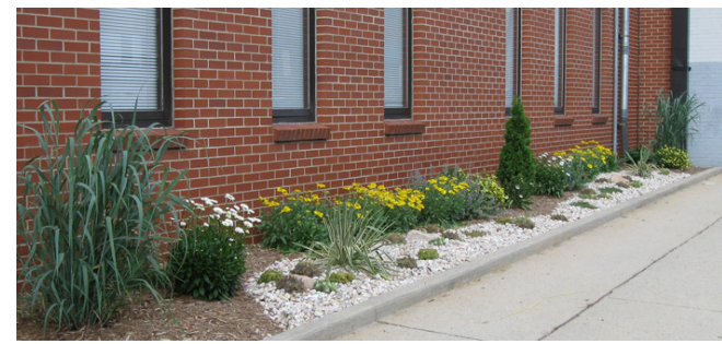
Avoided strip grass.

Avoid installing "strip grass" (e.g., small strips of grass between the sidewalk and street), because these areas are hard to maintain and difficult to water efficiently.