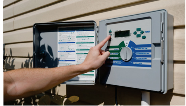
WaterSense labeled irrigation controller

soil moisture falls below a set threshold. These sensors can be connected to an existing controller or be installed in a new system to enable irrigation as needed by plants. Studies suggest that soil moisture-based control technologies can result in water savings of at least 20 percent.<sup>3</sup>